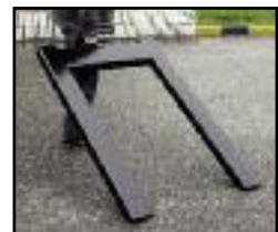
Handle and front-mounted rollers for convenient lifting and relocation of the scale