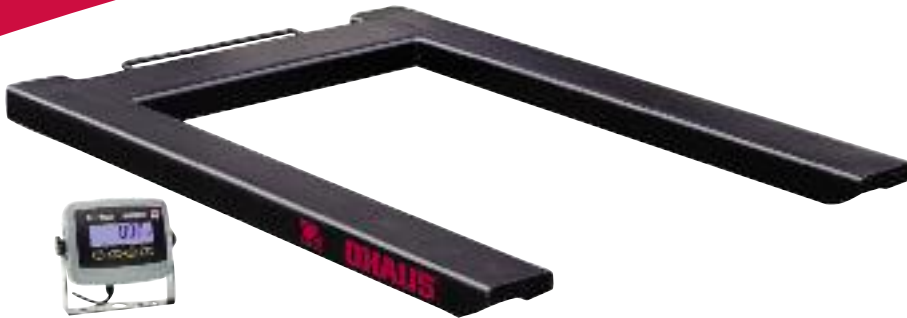
Painted steel model shown with T31P indicator