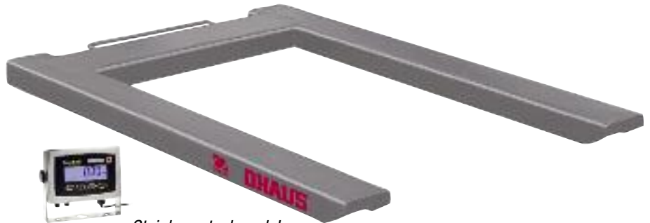
Stainless steel model shown with T31XW indicator